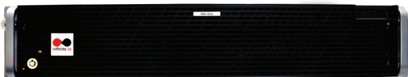
The NSC-055s is packaged in a standard 2U form factor x86 platform

UL60950 CSA 60950 EN60950 FCC /ICES-003 CE – EMC Directive 2004/108EC