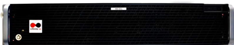
The NSC-055s is packaged in a standard 2U form factor x86 platform

UL60950 CSA 60950 EN60950 FCC /ICES-003 CE – EMC Directive 2004/108EC